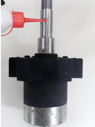
Figure 4: Add Thin Layer of Oil (Optional)

Please file this CEN Service Bulletin with your CEN Literature. Please forward a copy of this information to the appropriate people in your company.