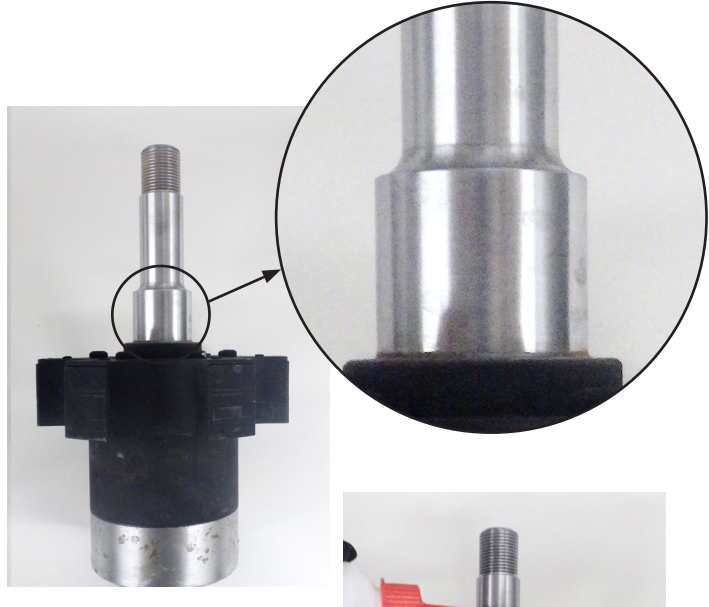
Figure 3: Example Part After Rust Removal