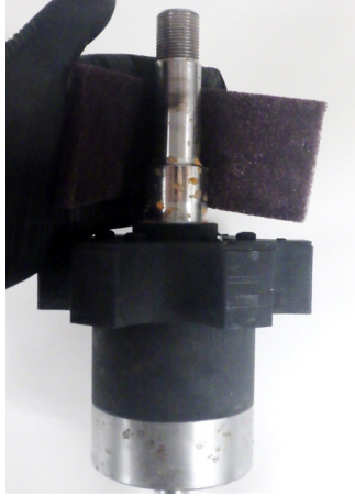
Figure 2: Remove Rust with Scouring Pad